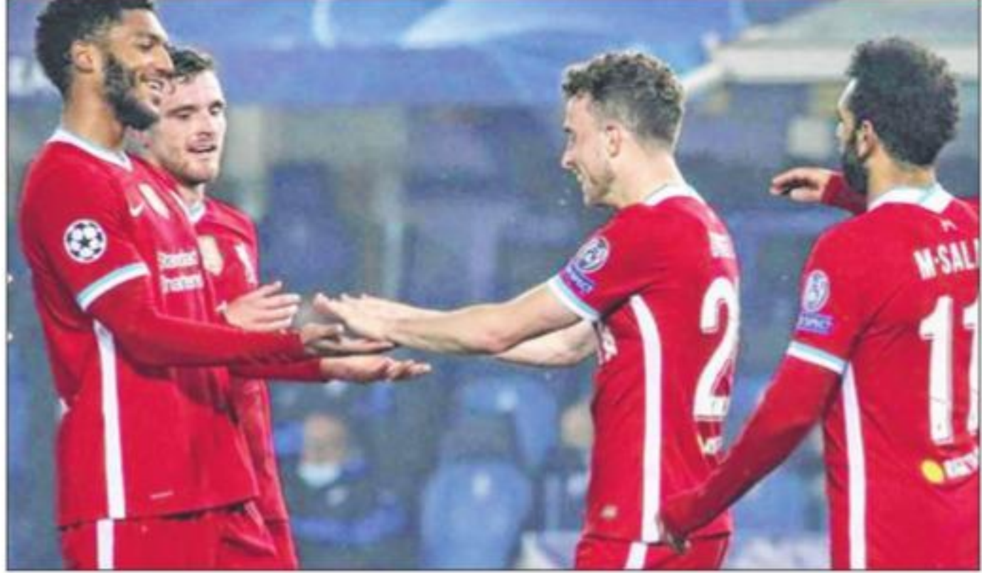
Liverpool players celebrate after the match

Elsewhere on the third match day of the group stage, 13-time champion Real Madrid beat visiting Inter