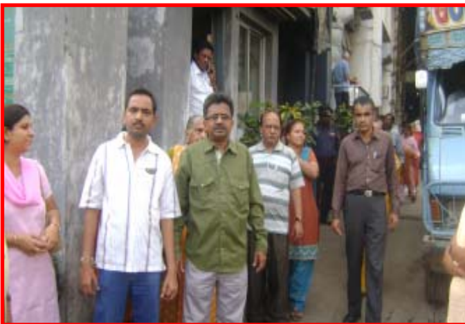
Visiting the Process House