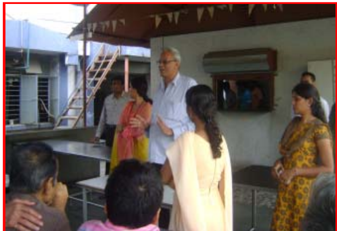
Interactive session with plant officials.