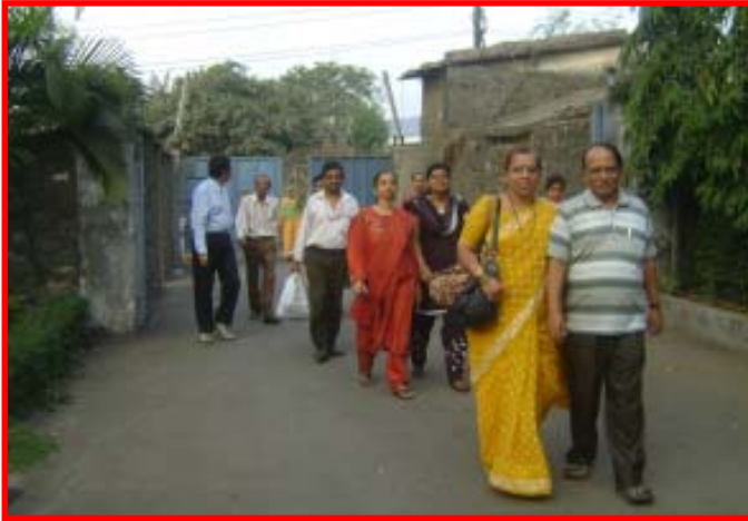
Visiting the Knitting & Garment Unit